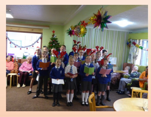
We finally presented our donation from the Garden Party to Fleetwood's Charity School.

We're lucky to live in a community where organisation s support each other. During December Kepplegate resídents were entertained by two primary schools, a junior brass band and Pilling Band.